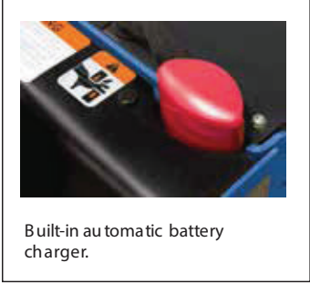
Built-in automatic battery charger.