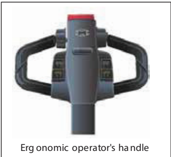
Ergonomic operator's handle