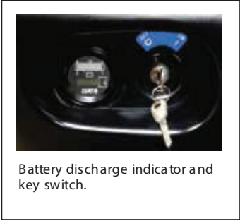
Battery discharge indicator and key switch.