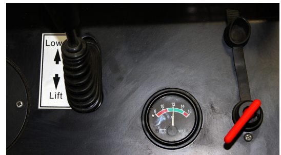
Easy access controls